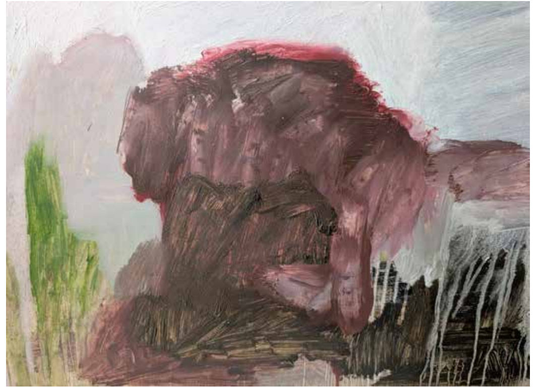
Red mountain with cypress tree, 2025, Oil paint on mount board, 40cm x 50cm