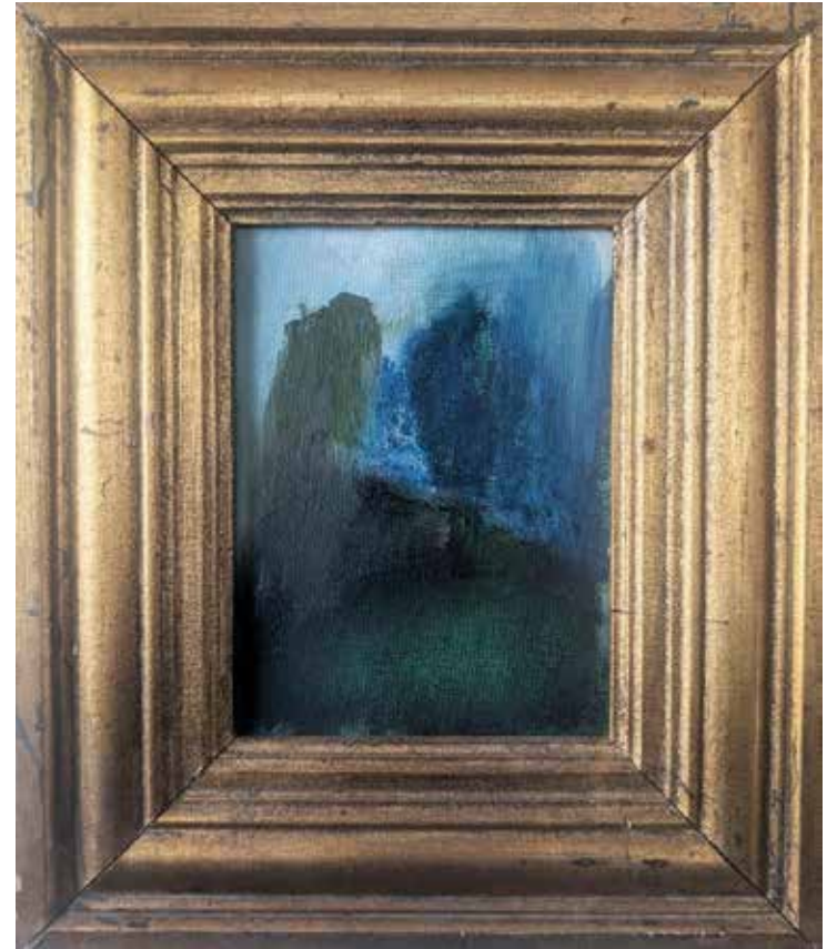
Two trees , 2025, Oil on canvas board, 15cm x 20cm - frame, 35cm x 30cm