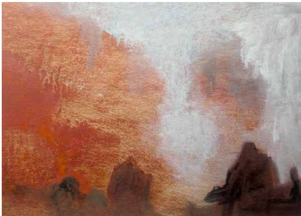
Flying home 2 , 2025, Oil paint, oil stick on photographic print, 30cm x 40cm