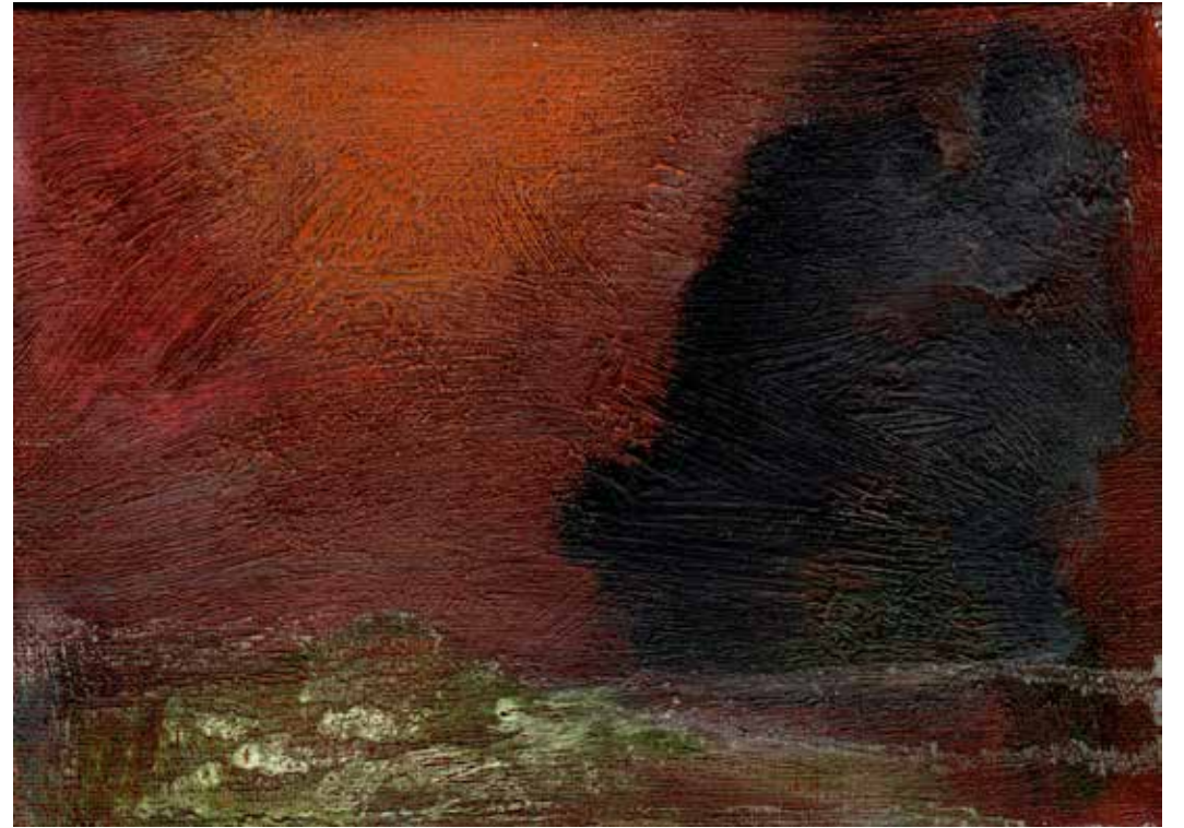
End of the continent , 2025, Oil on canvas board, 15cm x 20cm