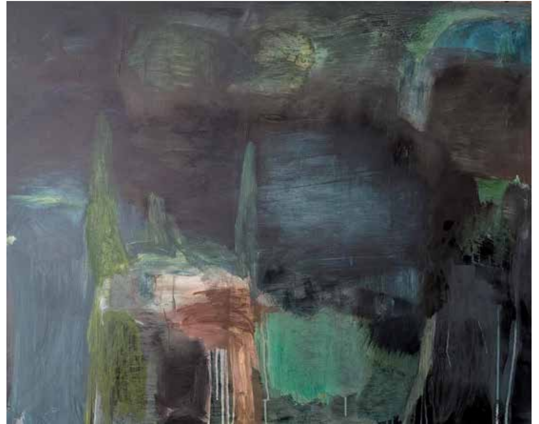
In the garden - Castlemaine , 2025, Oil paint, oil stick on aluminum, 66cm x 110cm