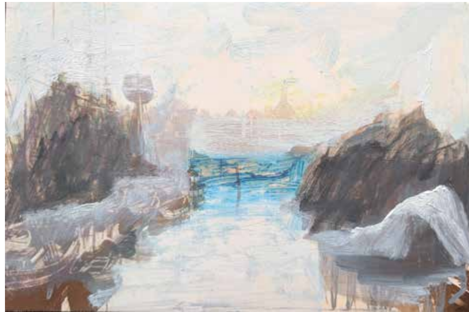
Turner's ships departing 2 , 2025, Oil paint, collage on card, 15cm x 23cm