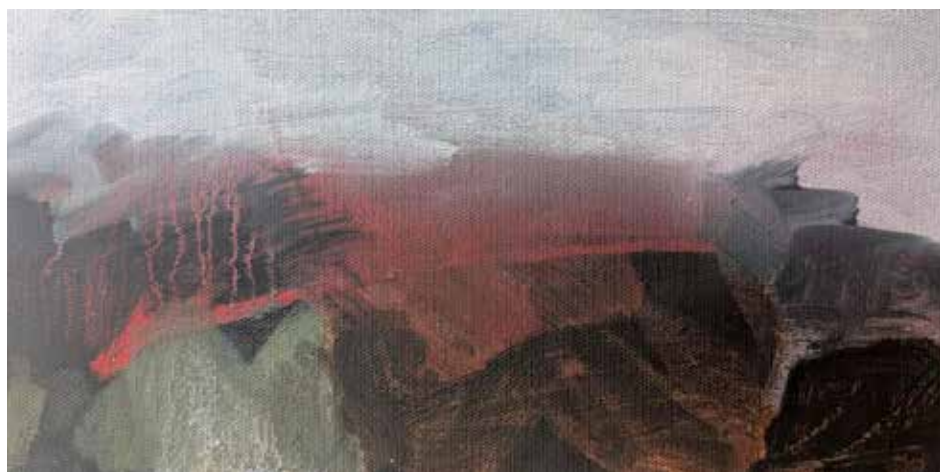
High country 1,2. 2025 Oil on canvas 15cm x 30cm each