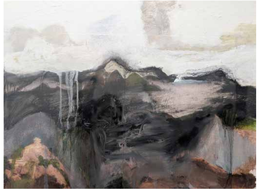
A small temple, 2025, Oil on canvas board, 40cm x 60cm