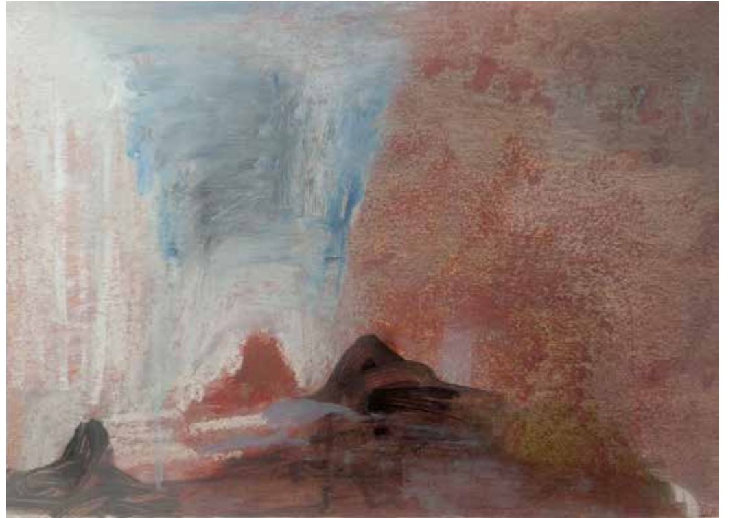
Flying home I , 2025, Oil paint, oil stick on photographic print, 30cm x 40cm