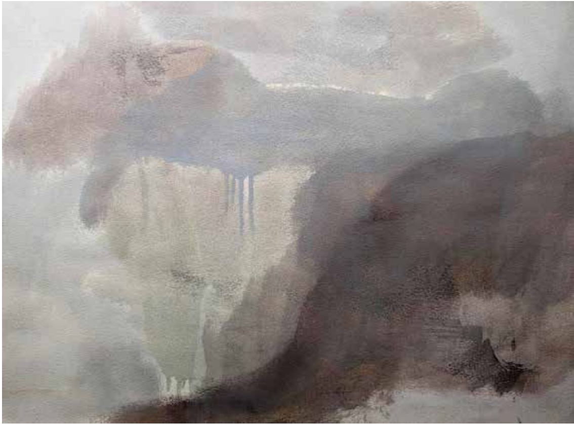
Fog I , Oil paint, oil stick on paper, 40cm x 50cm