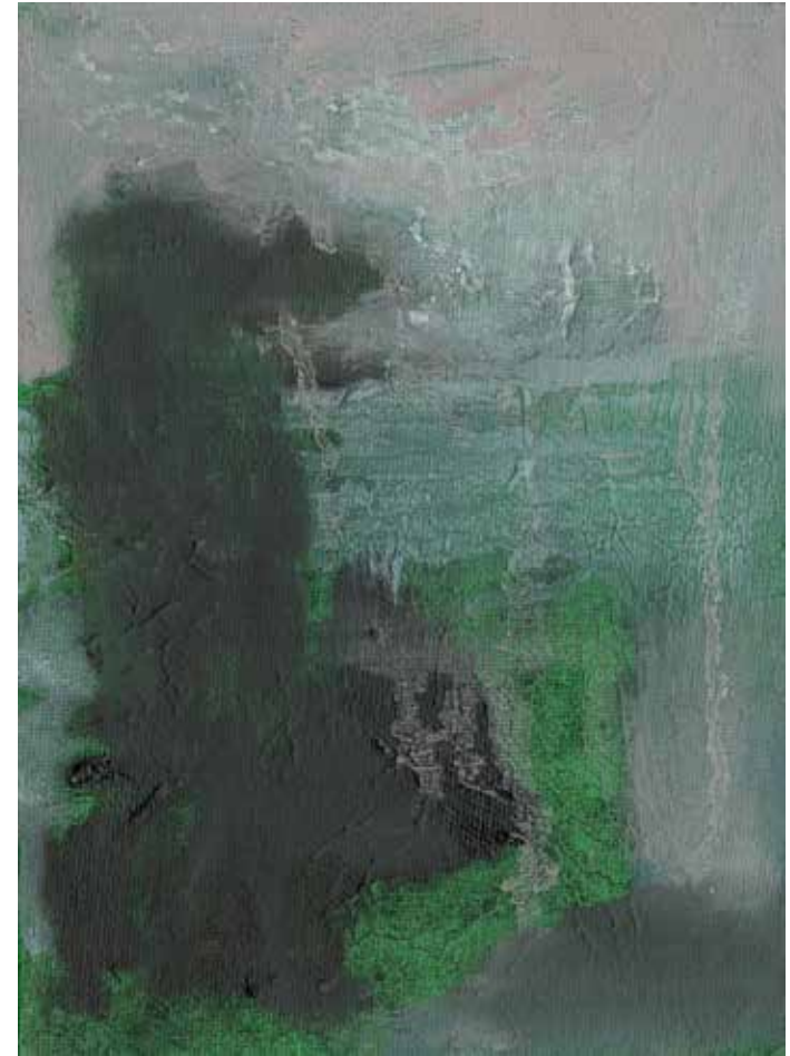
Looking into the forest - Urquhart street, 2025 Oil paint on canvas board 15cm x 20cm