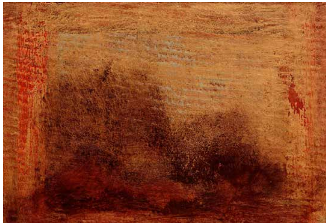
Flying home IB , 2025, Chinese paper, oil paint on board, 13cm x 17cm each