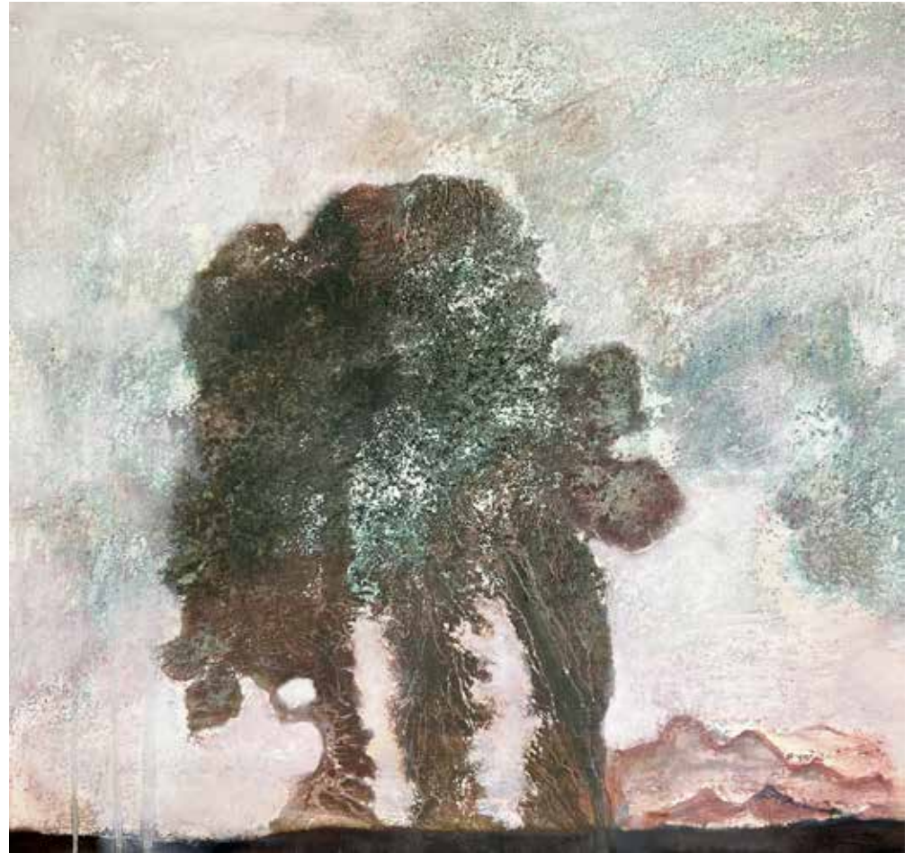
Black Tree , 2021 Acrylic, Oil Paint on Handmade Paper Dry Mounted on Dibond 70 cm x 75 cm