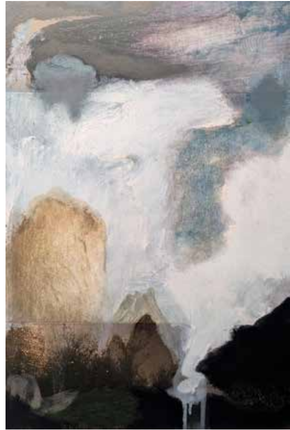
On the Li river, 2025, Oil on photographic print, 44cm x 30cm