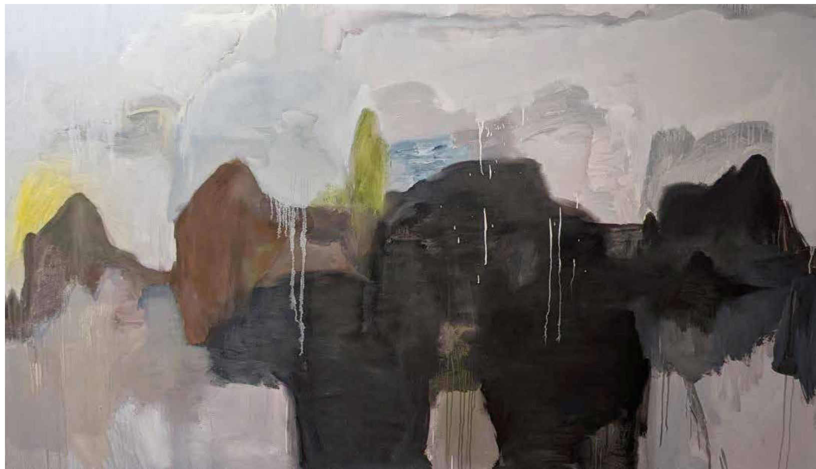
Over the range , 2025 Oil paint on canvas 110cm x 180cm