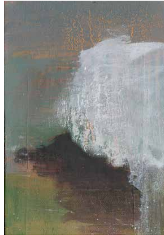
Snow storm approaching 1,2,3,4, 2025, Acrylic,oil on board, 18 x 13 cm each