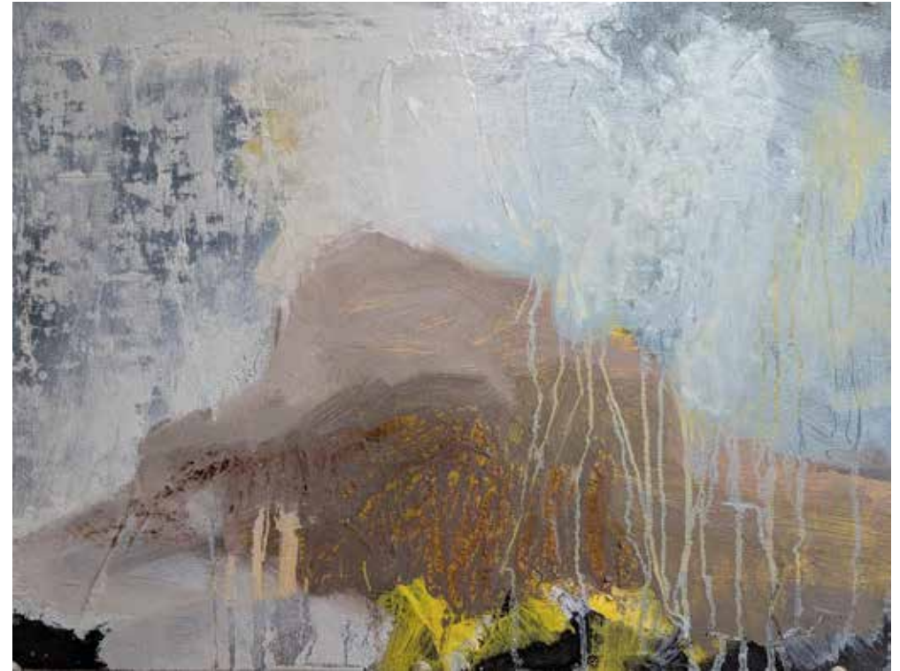
Rain on the highlands , 2025, Oil paint, oil stick on canvas board, 30cm x 40cm