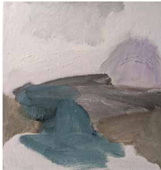
Abstracted landscape II , 2025, Oil paint on canvas, 25cm x 20cm