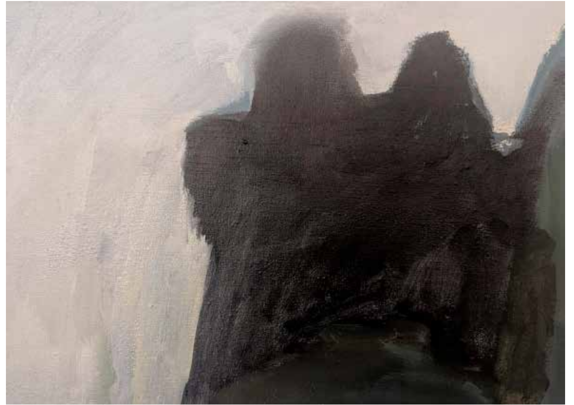
Escarpment at the end of the world 2, 2025, Oil on canvas, 30cm x 40cm