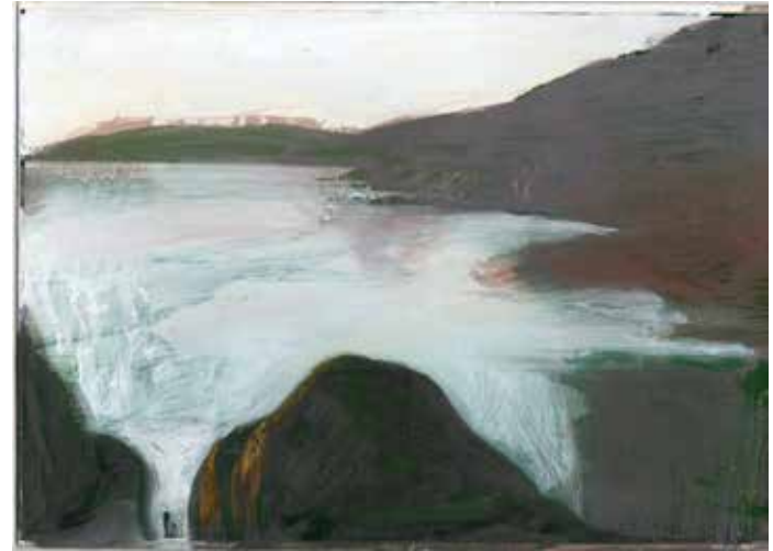
High lake , 2025, Oil paint, oil stick on photograph on board, 21cm x 30cm