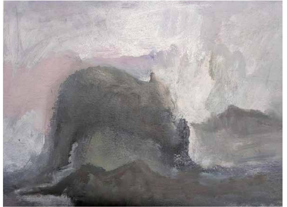
Fog II , Oil paint, oil stick on paper, 40cm x 60cm