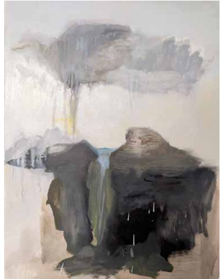
A cloud and a lake , 2025 Oil paint, oil stick on handmade paper 73cm x 57cm