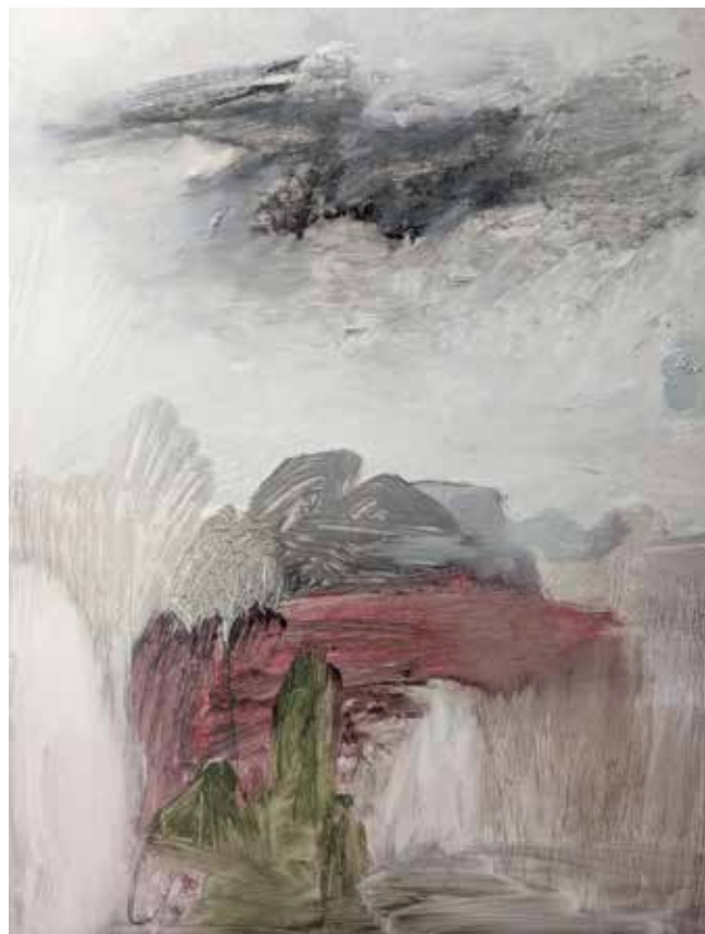
Floating landscape 1 , 2025, Oil paint, oil stick on photographic paper, 45cm x 35cm