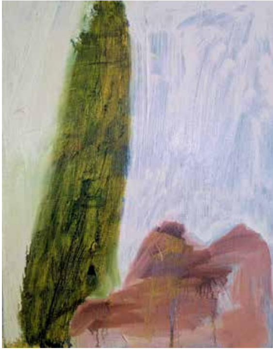
Large Cyprus , 2025, Oil paint on canvas, 60cm x 45cm