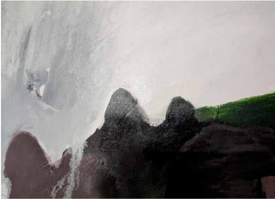
Escarpment at the end of the world 1, 2025, Oil on canvas, 30cm x 60cm