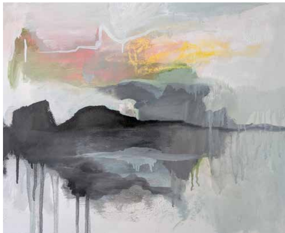
Sunset - dust storm , 2025, Oil paint on hand made paper, 40cm x 50cm