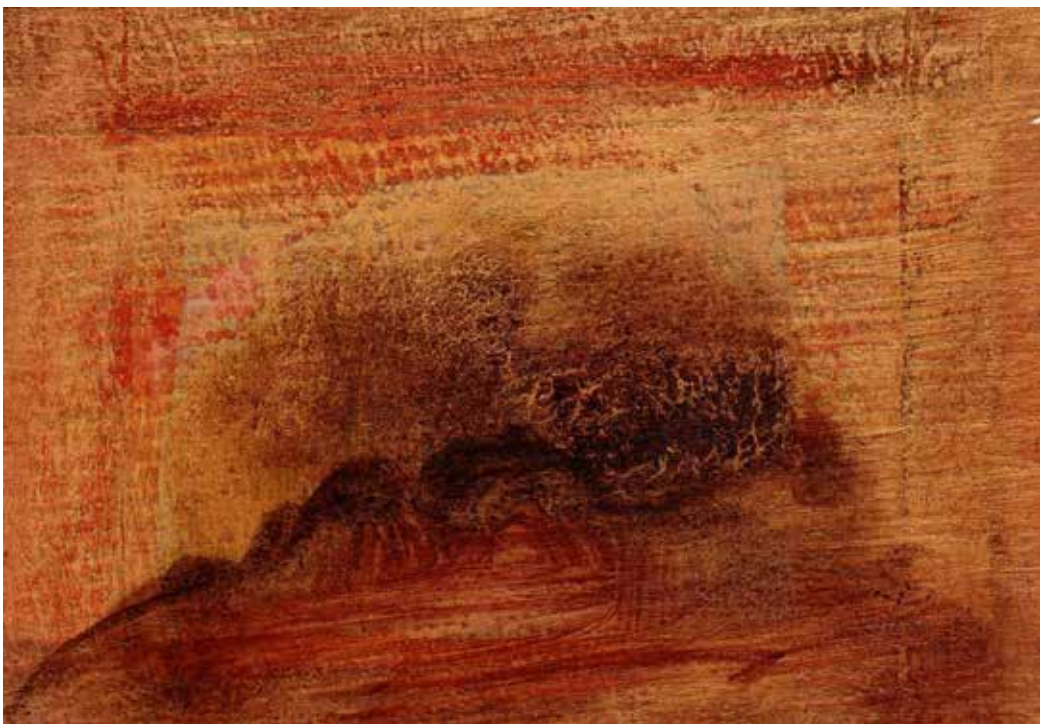
Flying home IA , 2025, Chinese paper, oil paint on board, 13cm x 17cm each