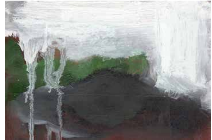
A snow storm on the horizon I , 2024, Oil paint on board, 12cm x 17cm