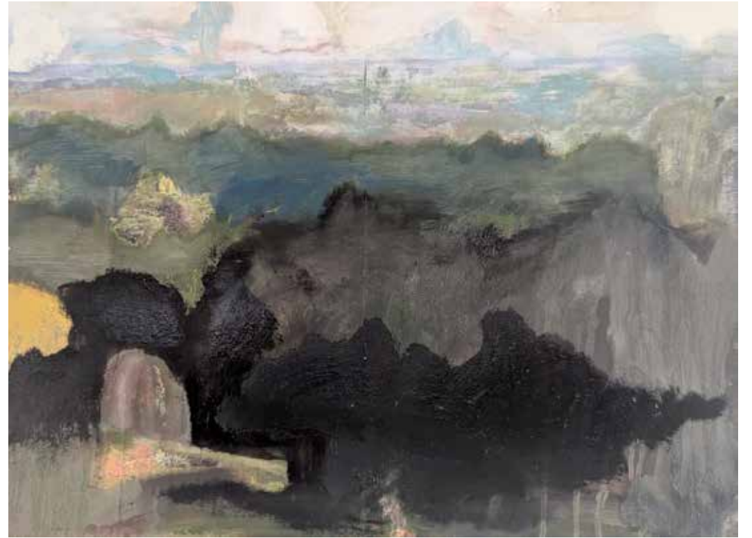
Over the ranges , 2025, Oil on canvas board, 40cm x 60cm