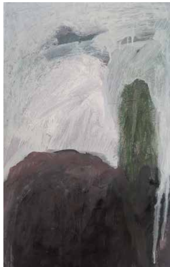
Black mountain I, II, III, 2025, Oil paint, oil stick on photographic print, 44cm x 30cm each