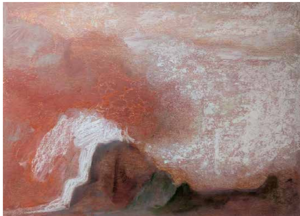
Flying home 3 , 2025, Oil paint, oil stick on photographic print, 30cm x 40cm