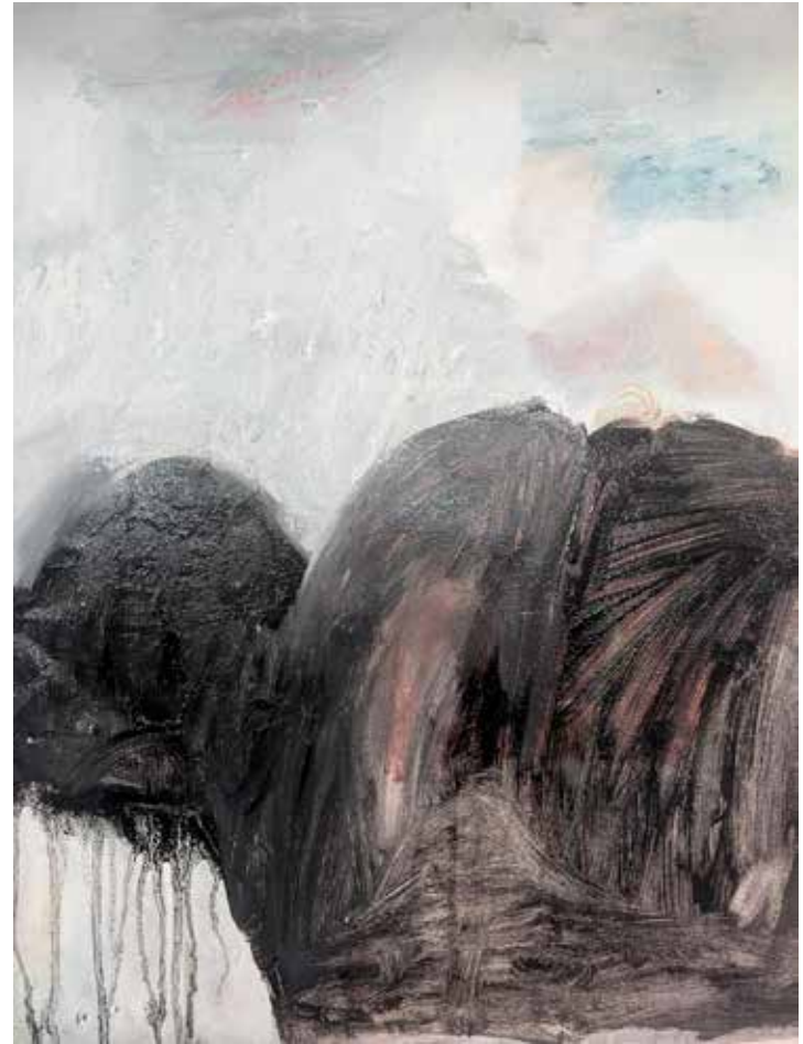
Two black mountains, 2025 Oil paint, oil stick on wall paper 50cm x 42cm