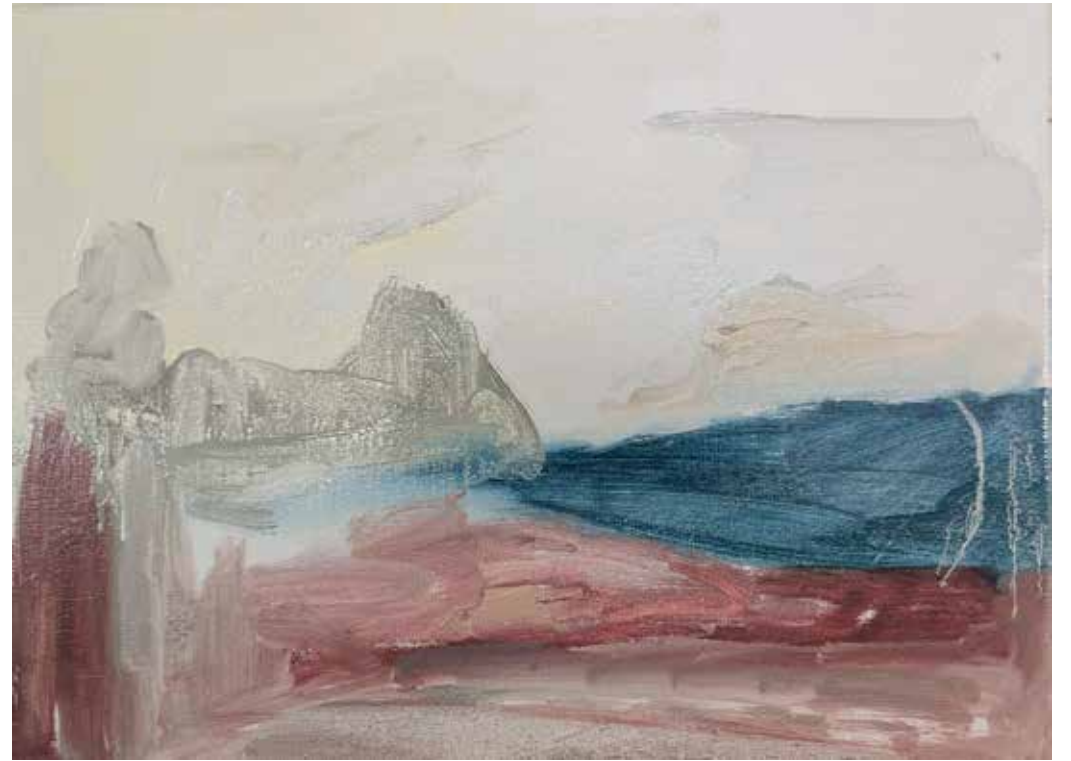
Blue Landscape 1, 2025, Oil on Canvas, 30cm x 41cm