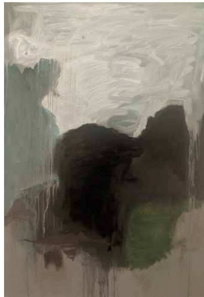
Storm approaching - China , 2025 Oil paint, oil stick on canvas 83cm x 69cm