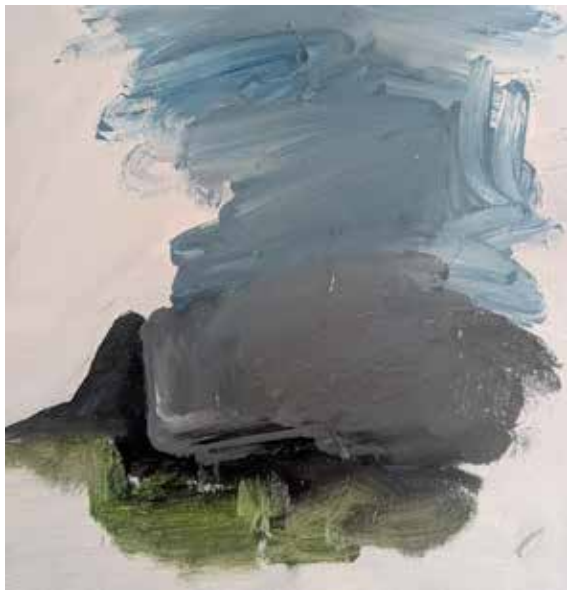
Abstracted landscape I , 2025, Oil paint on canvas, 25cm x 20cm