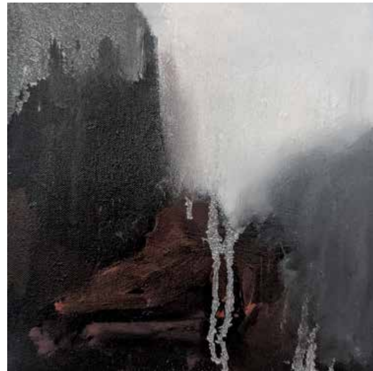
Fog , 2025, Oil paint on canvas, 25cm x 25cm