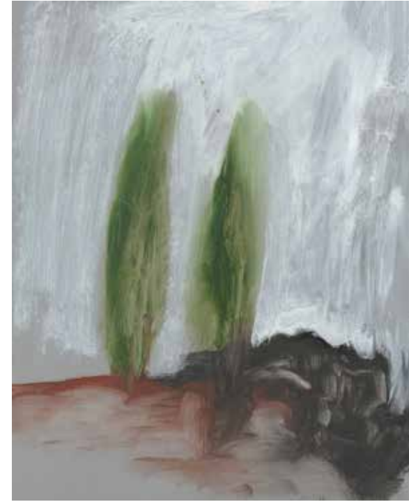
Two Cyprus trees at 82 Urquhart , 2025, Oil paint on card, 25cm x 20cm