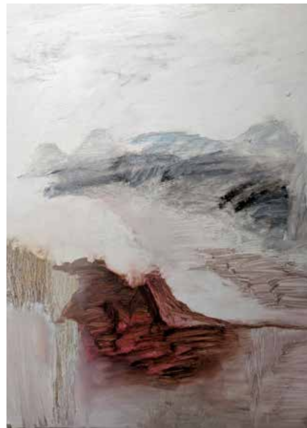
Floating landscape 2 , 2025, Oil paint, oil stick on photographic paper, 45cm x 35cm