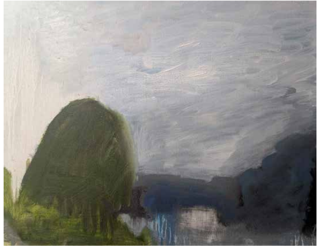
Land bridge , 2025, Oil paint on canvas, 40cm x 50cm

Previous spread A snow storm on the horizon 2,3,4,5, 2024, Oil paint on board 12cm x 17cm each