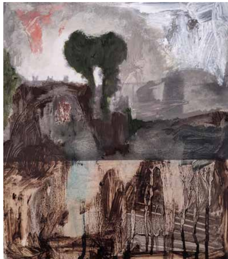
After Turner I, III, IV, 2005, Collage, oil paint on card, 24cm X 22cm