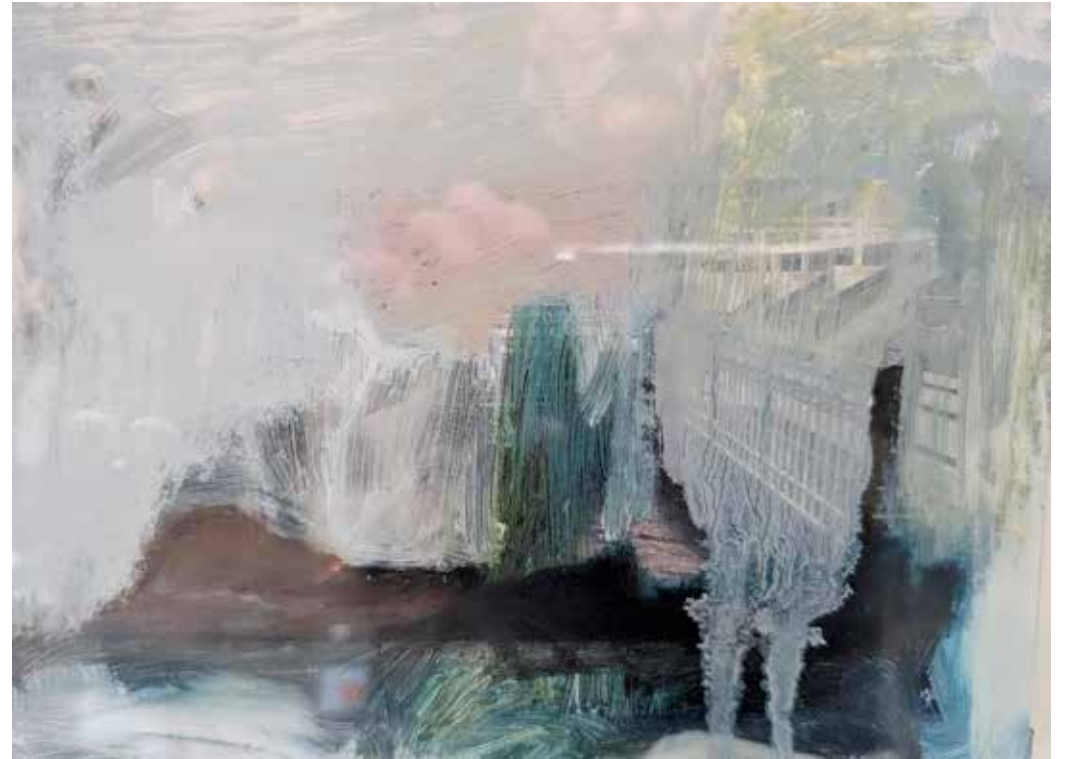
Spring Wall , 2025, Collage, oil paint on photograph on card, 15cm x 25cm