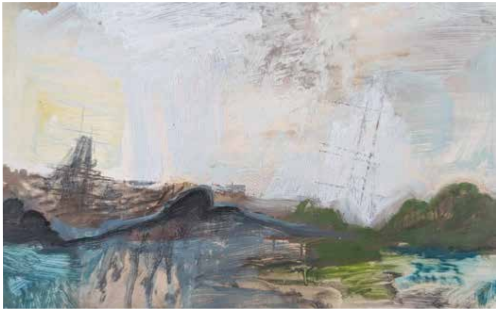
Turner's ships departing 1 , 2025, Oil paint, collage on card, 15cm x 25cm